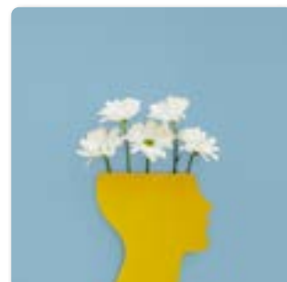
Managing your mental health