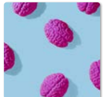
Disclosure of mental health at work