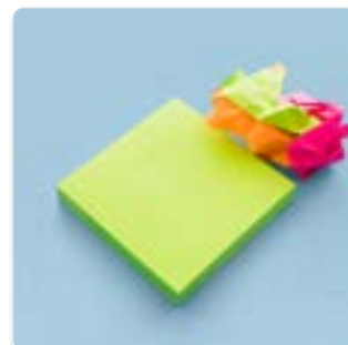
Recruitment and interview practice