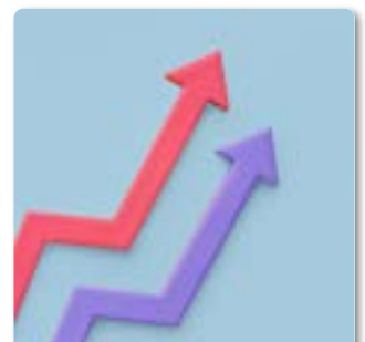
Career development and progression